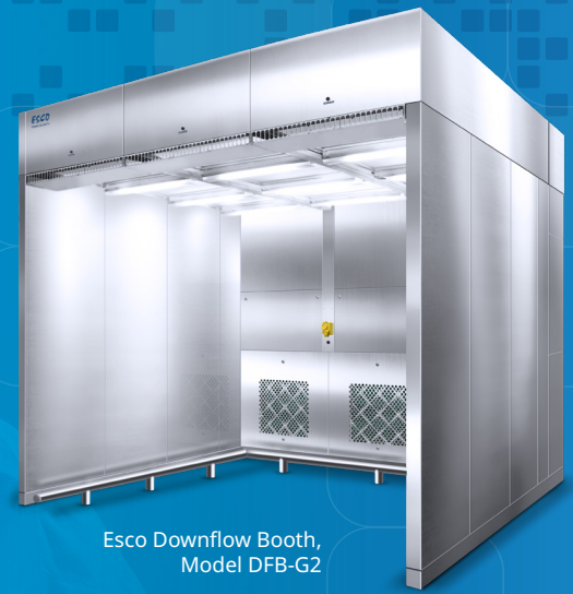
Esco Downflow Booth, Model DFB-G2